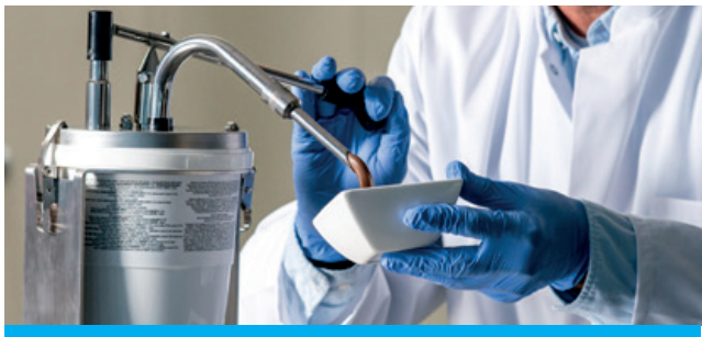
PART OF ASEPT > 60 YEARS OF EXPERIENCE