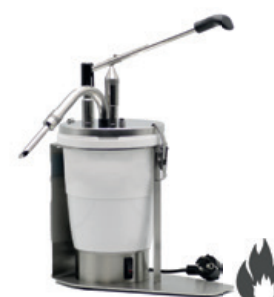
LEVER-ACTION DISPENSER WITH HOLDER PRODUCT CODE: EDU-SRW-1KB-3-V-SPEC