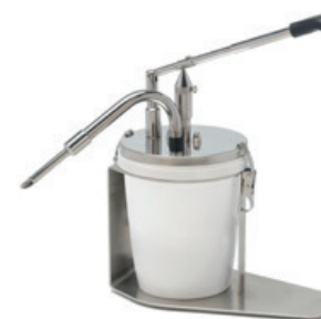
LEVER-ACTION DISPENSER WITH HOLDER PRODUCT CODE: EDU-1KB-3-V-SPEC