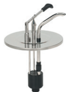
LEVER-ACTION DISPENSER WITH LID PRODUCT CODE: EDU

Our high quality lever-action dispensers are perfectly suited for professional use in the food industry. Quickly dispense 25 to 40 grams of toppings, dressings, sauces, etc. The lever-action dispensers are available for both hot and cold substances.