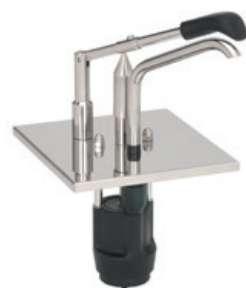
LEVER-ACTION DISPENSER FOR GASTRO-NORM PRODUCT CODE: EDU-GN