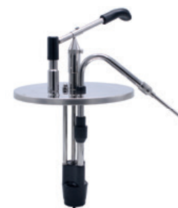
LEVER-ACTION DISPENSER WITH LID PRODUCT CODE: EDU-1KB