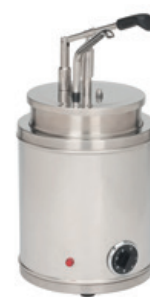
LEVER-ACTION DISPENSER WITH HOT-POT PRODUCT CODE: HP-DU