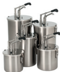
LEVER-ACTION DISPENSER WITH CONTAINER PRODUCT CODE: CRS-DU